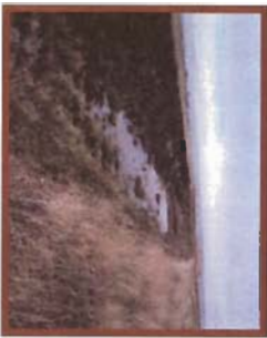
Uncapped, Sunken Pit

Culls disposed of in this manner must be managed and covered as recommended by the University of Idaho Agricultural Extension Service. Among other things recommended by them, the pits must be capped with a "hat" in order to cause water to run off of the pit instead of collecting over it. This cap must be maintained even as the culs in the pit decompose and the pit sinks.