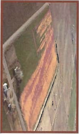
To thick to be plowed