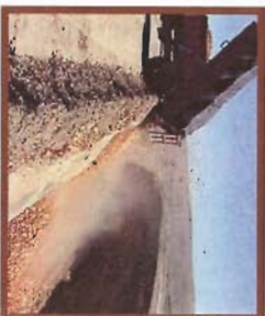
Proper pit to be covered