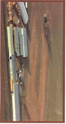
Spread out well, but needs to be buried