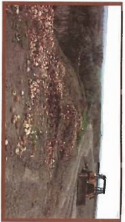
Pushed over the cliff is not acceptable